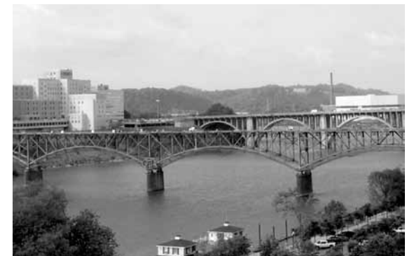
The Gay Street and Henley Bridges have been protected with an H-1 Historic Overlay in the past year. The Gay Street Bridge has been rehabilitated; while the Henley Bridge is scheduled for rehabilitation in the next few years.