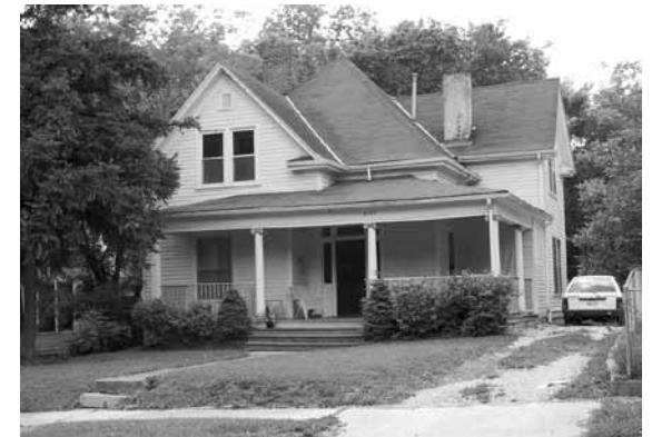
2045 Washington Avenue was rehabilitated in 2003-04 by Knox Heritage, Inc., as part of its Vintage Homes program. The house is included in the Edgewood-Park City H-1 Historic overlay, and is now in single family ownership.

Preservation achievement grew during this time, resulting in rehabilitating late 19 th and early 20 th century buildings and neighborhoods throughout Knoxville. New and old residents of Mechanicsville banded together to create the city's first residential H-1 historic overlay in 1991. Old North Knoxville followed suit in 1992 and in late 2003, worked with the Knoxville Historic Zoning Commission to develop a revised set of design guidelines for the original historic overlay. Since Preservation 2003 was prepared a number of properties have achieved H-1 historic overlay status, and a number of neighborhoods are now working to secure either Neighborhood Conservation or Historic overlays. Those neighborhoods include Old North Knoxville, which is contemplating an expansion of its original area, North Hills, Oakwood-Lincoln Park, Holston Hills and Sequoyah Hills. Boundaries and design guidelines for these areas have not yet been developed. A list of designated properties is included in "The Properties" section of this report.