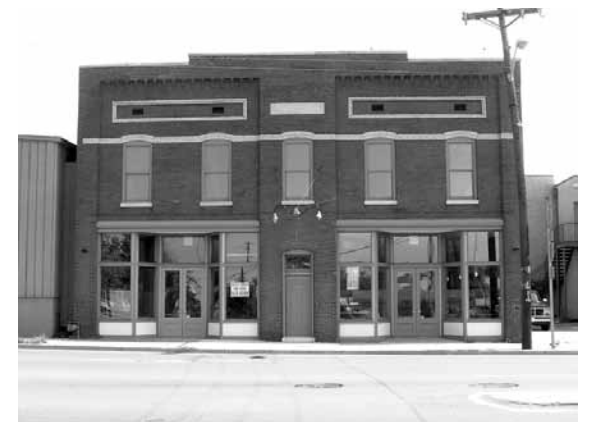
The Rogers-Wylie Building/Western Heights Hardware at 1545 Western Avenue, being rehabilitated at the time of this photo, now provides office space at the edge of the Mechanicsville (H-1) Historic District. The Victorian Vernacular Commercial building is noted for its storefront and ocular side windows.