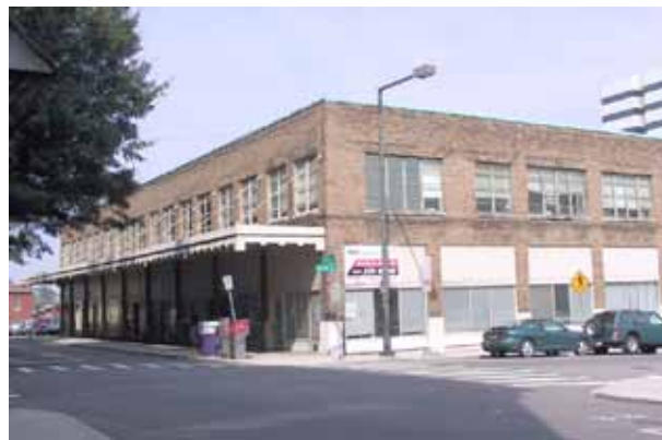
The Daylight Building

Several neighborhoods continue to be interested in increasing the area covered by historic overlays. Old Mechanicsville Neighborhood Interests has been working through its board to finalize an updated set of design guidelines; those are now in final draft and should proceed through the approval process in the next few months. Old North Knoxville continues a strong interest in including additional properties on its boundaries, and has begun efforts to contact property owners and assess the interest in enlarging the overlay. The same is true for the Edgewood-Park City H-1, where strong reinvestment has occurred in the past few years, and interest in additional designations seems to be increasing. Both Fourth and Gill and Market Square have indicated an interest in updating their guidelines, as well.