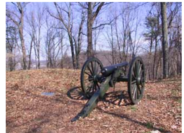
A Civil War cannon at Fort Dickerson

Other programs recommended in the past that could assist in preserving buildings and strengthening historic neighborhoods include working with The University of Tennessee to protect university owned or impacted historic buildings and developing a parking permit system for Ft. Sanders and other neighborhoods developed before private automobiles and off-street parking were common.