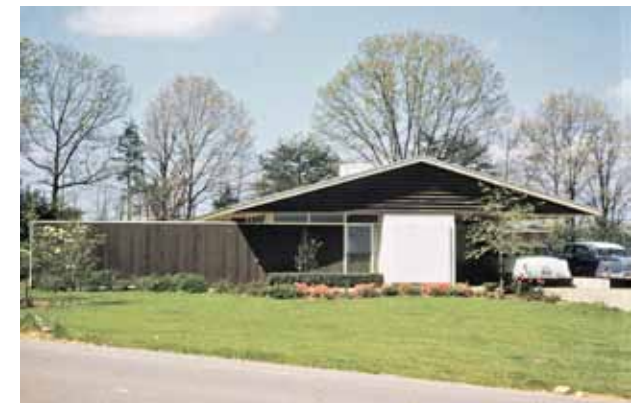
The Hotpoint House

The Commission has been working to develop guidelines for solar installations on historic buildings. The draft guidelines will be distributed to interested individuals and historic overlay districts, with the goal of incorporating measures that will allow the installation of solar devices into the guidelines for each district. As part of the increased interest by the public in updating windows and retrofitting houses for decreased energy consumption, several representatives from historic neighborhoods will begin to meet with staff and interested commissioners to develop suggestions for appropriate retrofitting, storm window installation, or new window replacement if that is necessary. Knox Heritage, with its recently completed LEEDS-certified rehabilitation of the house at 1011 Victorian Way (formerly Laurel Avenue), has both fueled interest in environmentally-sensitive rehabilitation while demonstrating techniques and materials that can environmentally enhance a preservation rehabilitation project.