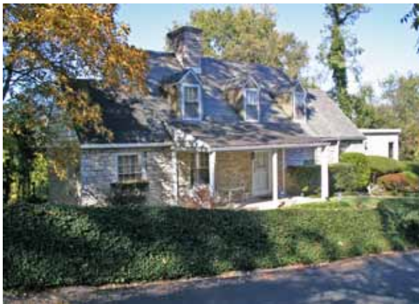
Gobblers Knob/Sherrod Road neighborhood

From 1982 to 1985, MPC conducted an inventory of buildings and structures in the city, and in 1987, produced the first edition of The Future of Our Past , a preservation plan calling attention to historically and architecturally significant properties in Knoxville and Knox County. The plan was updated in 1994 in a second edition, also titled The Future of Our Past .